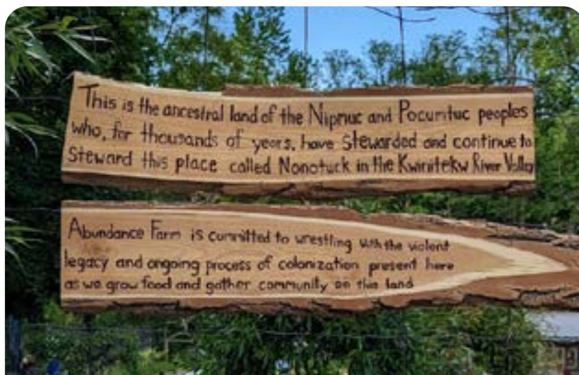
Sign posted at Abundance Farm Northampton, MA.