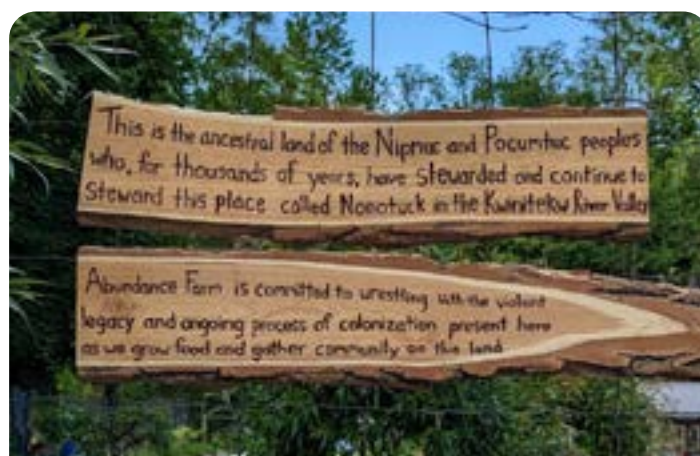
Sign posted at Abundance Farm