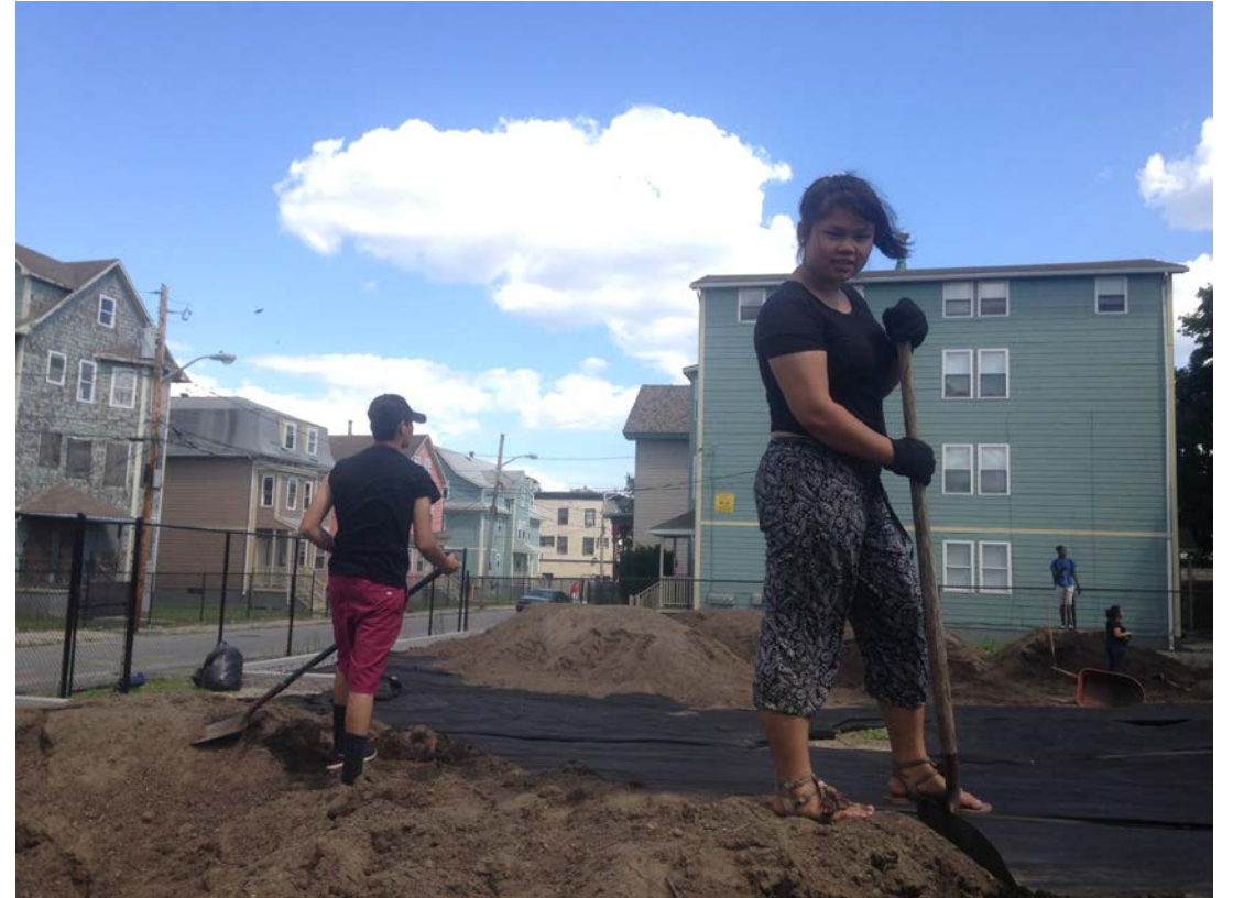
SCLT Youth Staff spreading soil at the Somerset Hayward Community Farm, summer 2016