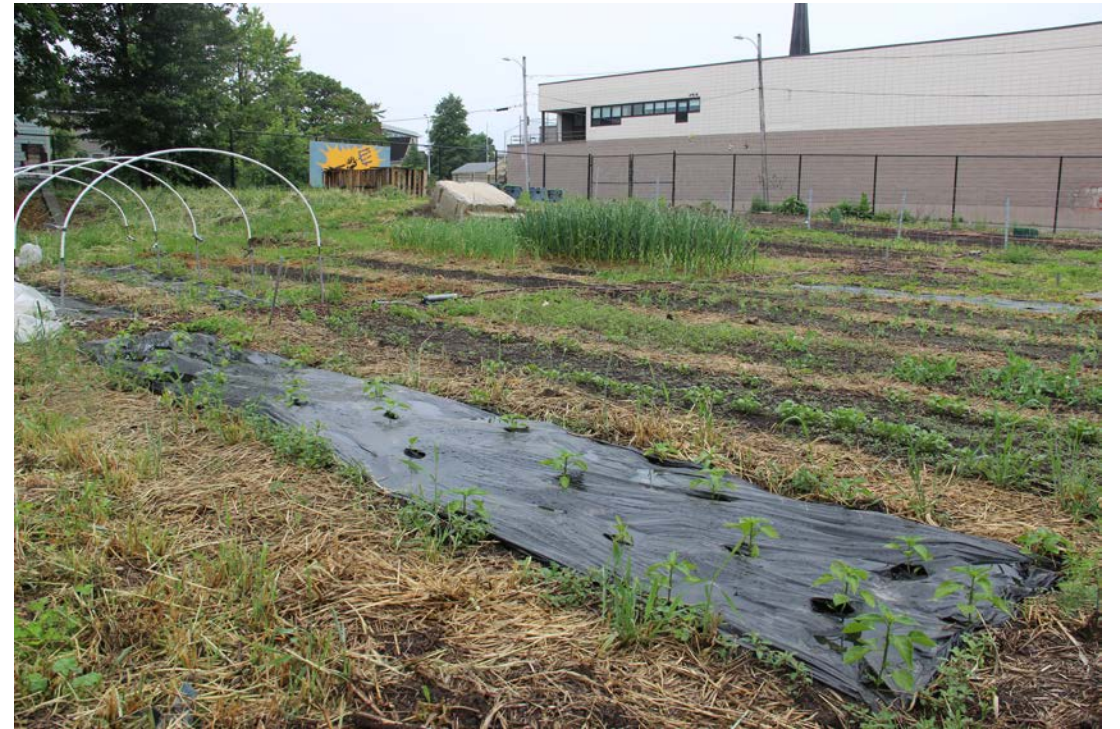
June 2017, first year of production