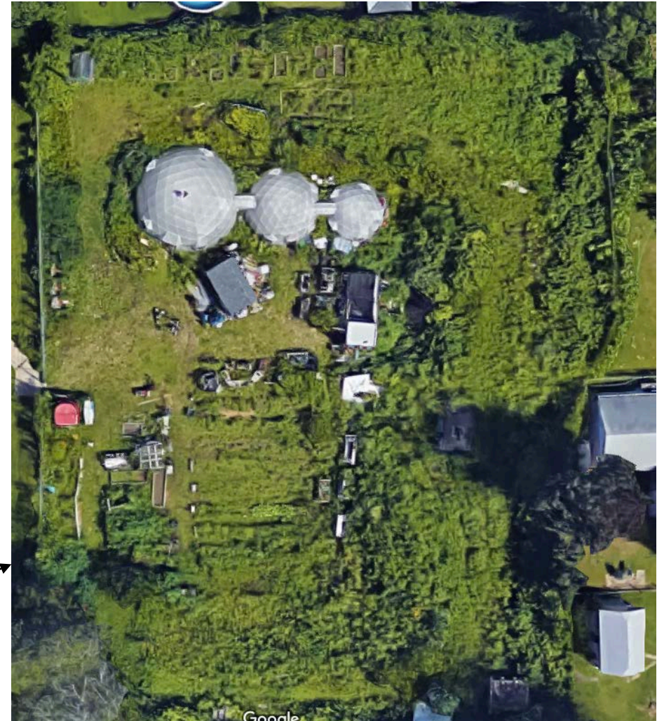
Galego Community Farm