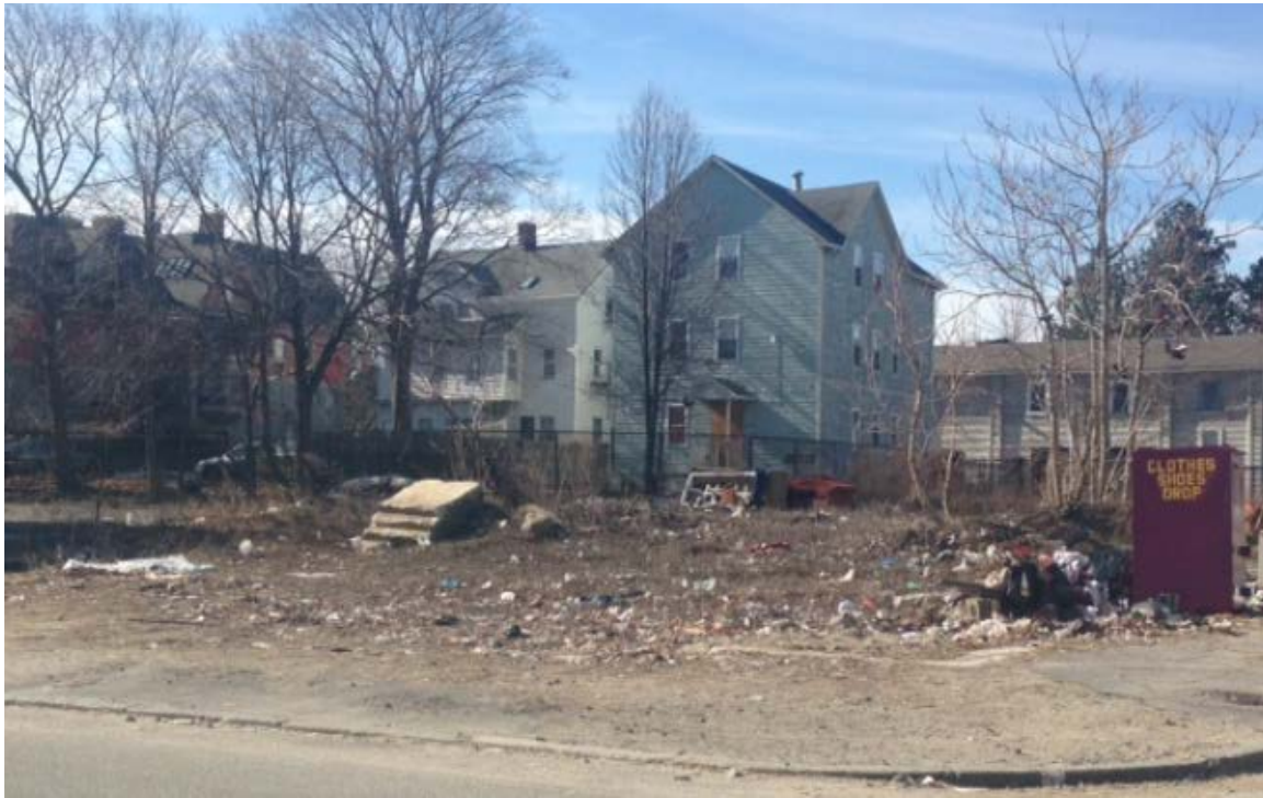
2015, Initial conditions